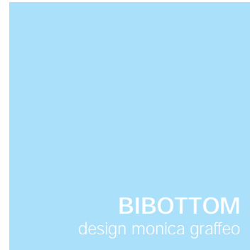
BIBOTTOM design monica graffeo