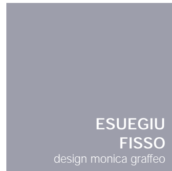
ESUEGIU FISSO design monica graffeo