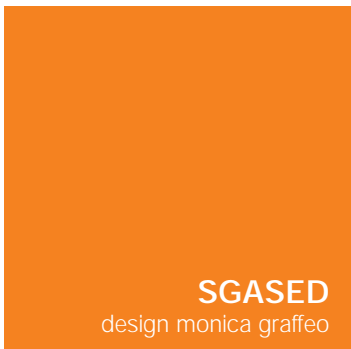
SGASED design monica graffeo