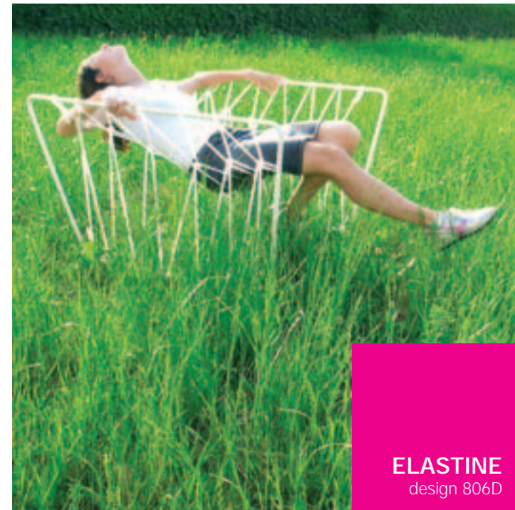
ELASTINE design 806D

disguincio® produces design objects, with unconventional lines that adhere to criteria of wellbeing, sensations, and interpersonal relations. It is inspired by art rather than interior design and is suitable for community areas such as airports, swimming pools, discos, hotels, wellness centres, gyms, where the impact of objects often has not yet stirred sensations. disguincio® is expressive, intense, attractive, unorthodox... and "unrestrictive"