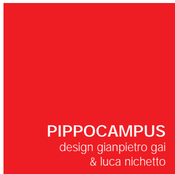
PIPPOCAMPUS design gianpietro gai & luca nichetto