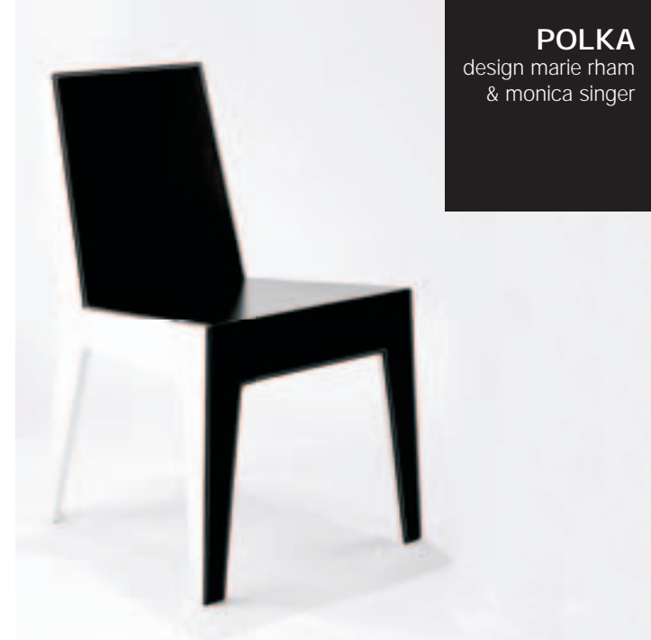
POLKA design marie rham & monica singer