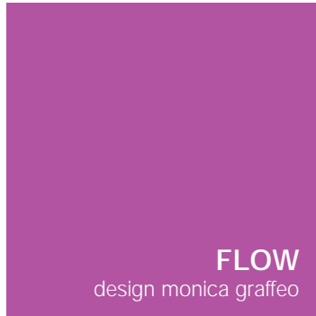
FLOW design monica graffeo